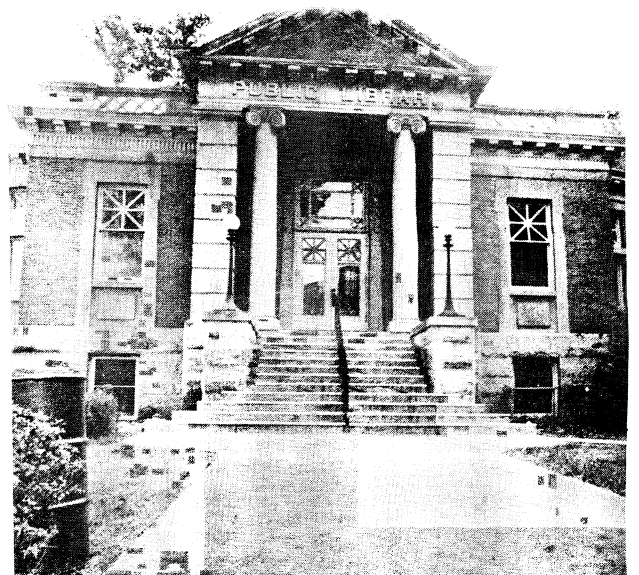
Ripon's 65 year old public library

Is it any wonder libraries are important?