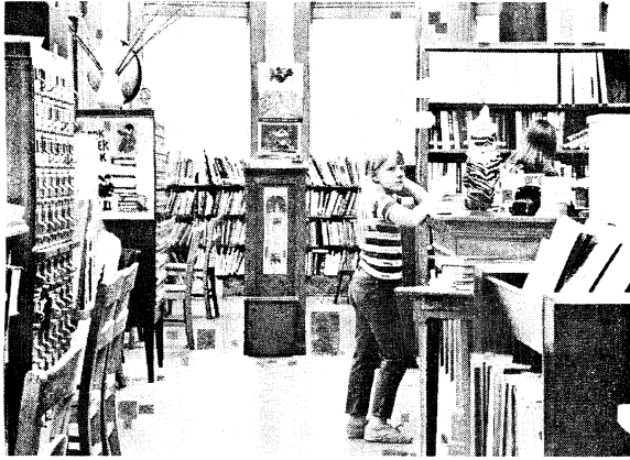
Time and use have out-distanced Ripon's present library