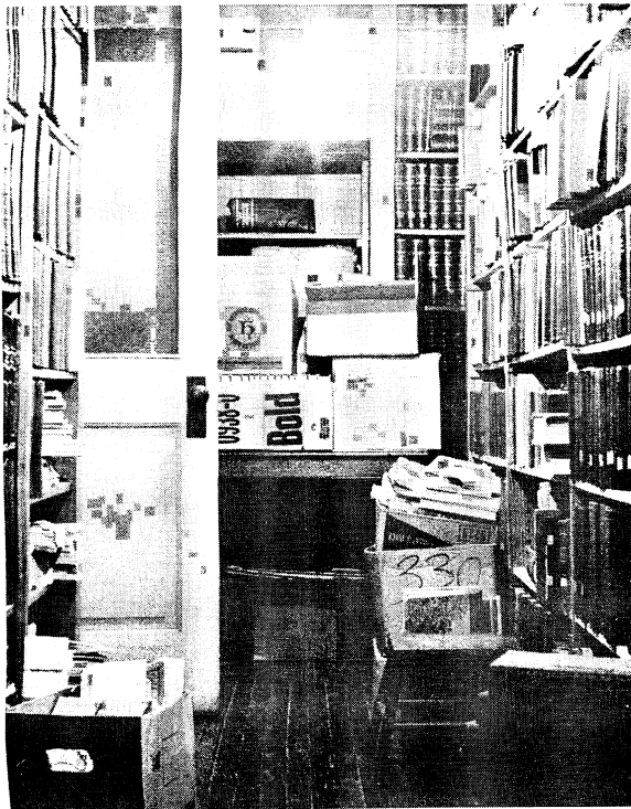
Lack of proper storage space...